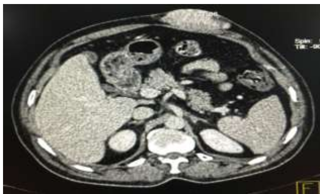
Fig 2 : CECT

After all the needful investigations patient was taken for surgery. Informed consent, including risk, benefit and alternatives given to the patient and family & documented. An upper abdomen transverse incision taken to excise the growth completely. Recovery was uneventful and patient is on regular follow up with us. Figure 3 showing the healing wound after one month. Specimen send revealed Dermatofibrosarcoma protuberans on histopathological examination (HPE). Figure 4 showing HPE of the specimen.