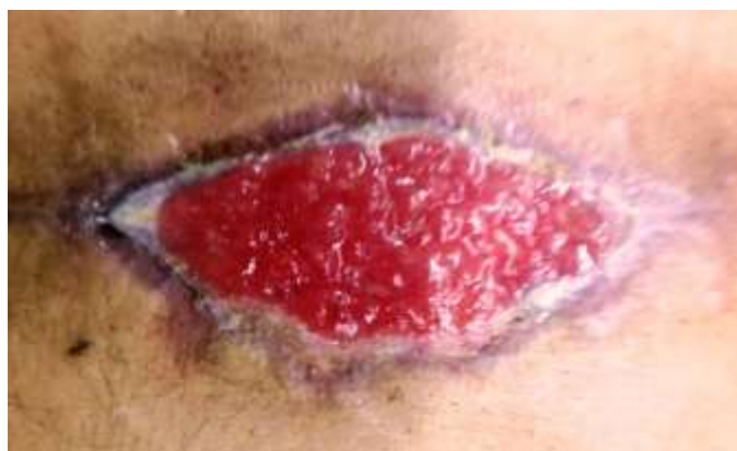
Fig 3 : Post op 1 (M)

After all the needful investigations patient was taken for surgery. Informed consent, including risk, benefit and alternatives given to the patient and family & documented. An upper abdomen transverse incision taken to excise the growth completely. Recovery was uneventful and patient is on regular follow up with us. Figure 3 showing the healing wound after one month. Specimen send revealed Dermatofibrosarcoma protuberans on histopathological examination (HPE). Figure 4 showing HPE of the specimen.